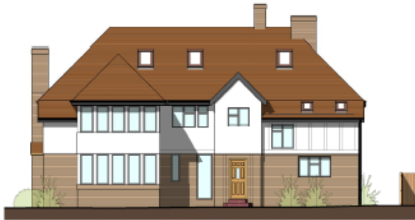
Proposed North-East Elevation

KINGSMEAD, KINGS LANE, CHIPPERFIELD, KINGS LANGLEY, WD4 9EN