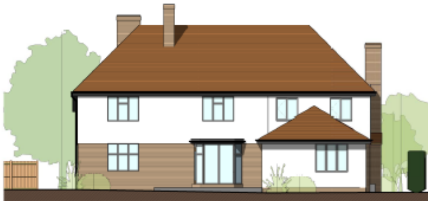
Proposed South-West Elevation