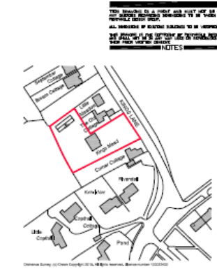
Scale 1:1000 Location Plan

NOTES 1. THIS DRAWING IS A PRELIMINARY AND MUST NOT BE USED FOR ANY OTHER PURPOSES WITHOUT THE WRITTEN CONSENT OF THE ARCHITECT. 2. ALL DIMENSIONS OF BUILDING ELEMENTS TO BE VERIFIED BY THE ARCHITECT PRIOR TO CONSTRUCTION. 3. THE ARCHITECT IS NOT RESPONSIBLE FOR THE ACCURACY OF THE INFORMATION PROVIDED BY OTHER PROFESSIONALS. 4. THE ARCHITECT IS NOT RESPONSIBLE FOR THE ACCURACY OF THE INFORMATION PROVIDED BY OTHER PROFESSIONALS.